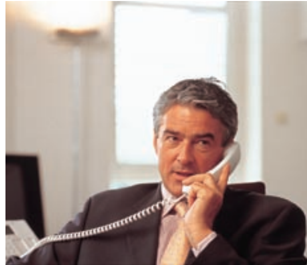
Calls can be directed to a specific individual,

To insure you are leveraging all of the advantages and cost benefits of your network the system software can automatically route calls to their destination using the least expensive path.