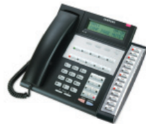
iDCS 18D with 14AOM