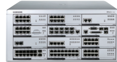
OfficeServ 7400 100 ~ 400 Users